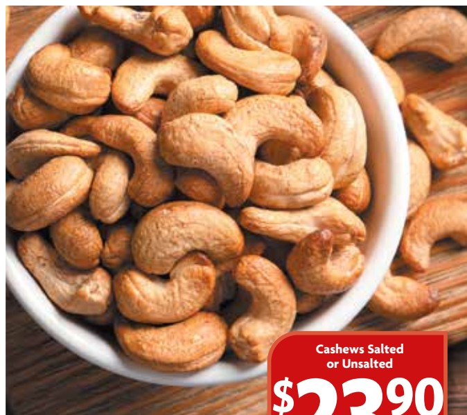
Cashews Salted or Unsalted