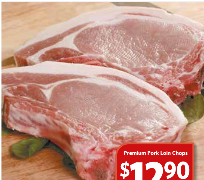
Premium Pork Loin Chops