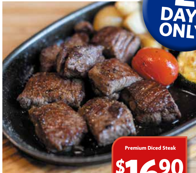
Premium Diced Steak