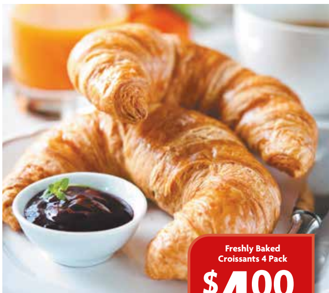
Freshly Baked Croissants 4 Pack