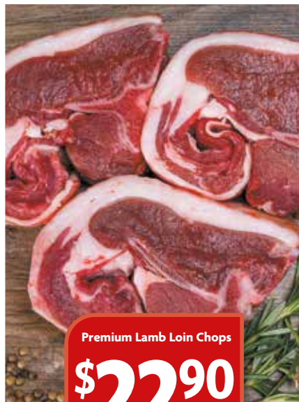
Premium Lamb Loin Chops

Made in Australia from 98% Australian ingredients