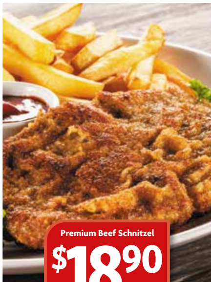
Premium Beef Schnitzel