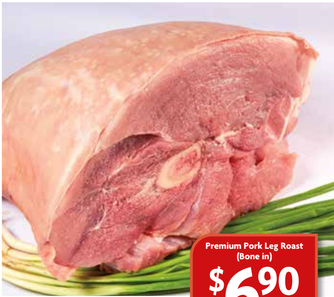
Premium Pork Leg Roast (Bone in)