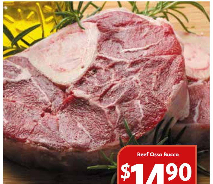
Beef Osso Bucco